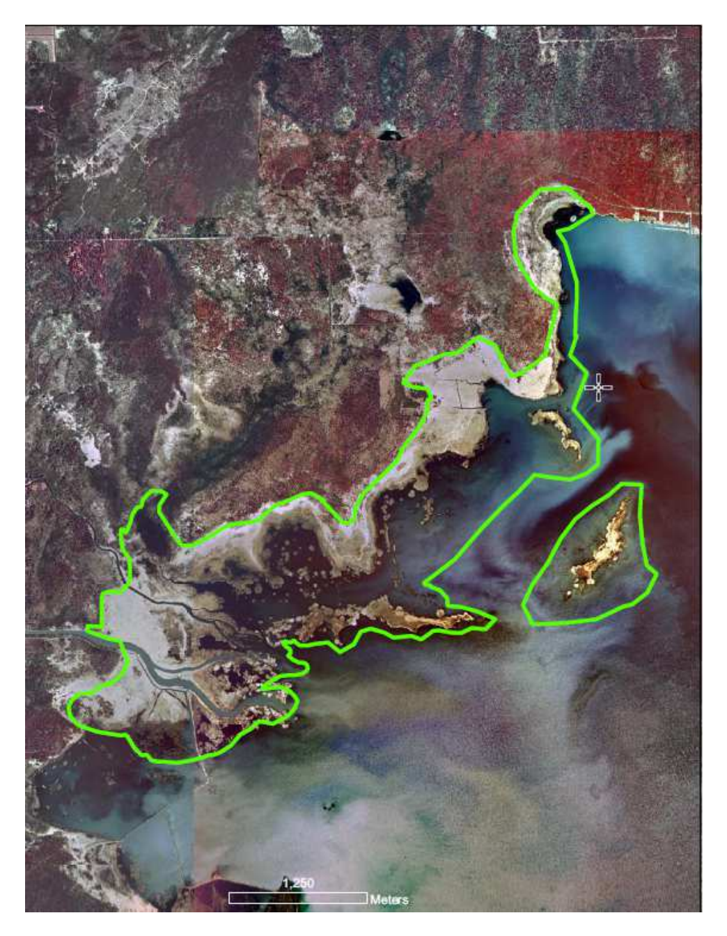
Figure 4. 1998 aerial photograph of the Munuscong and Little Munuscong Rivers and Pickford Point Great Lakes Marsh.