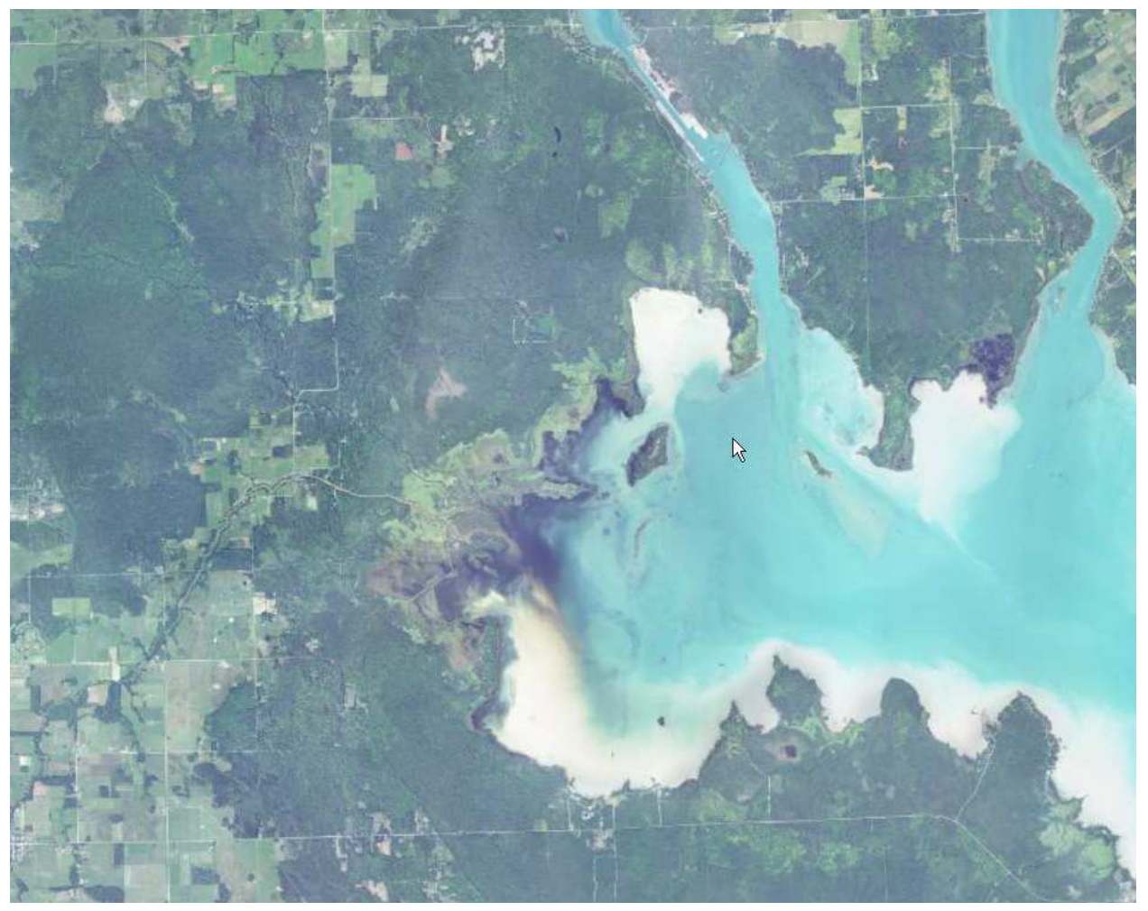
Figure 3- Landscape view of Munuscong Bay (2016 NAIP imagery)

Great lakes marsh is ranked G2 S3, globally imperiled and rare or uncommon in the state.