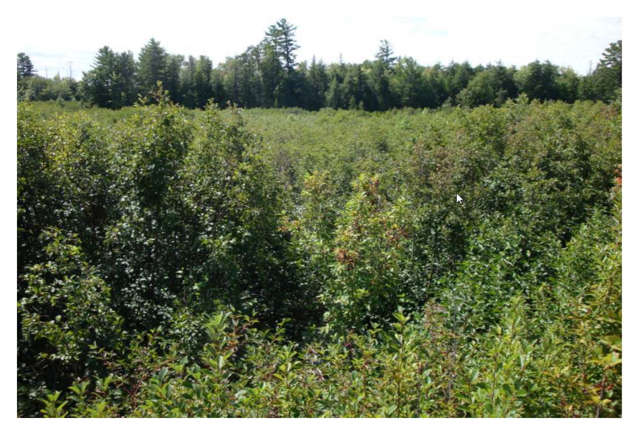
Figure 9. Northern shrub thicket is a shrub-dominated wetland located north of the climactic tension zone, frequently occurring along streams, and dominated by tag alder.

This EO is 41.46 acres in size and is dominated by dense (70-90% cover) alder ( Alnus rugosa ) with other tall shrubs including wild raisin ( Viburnum cassinoides ) and slender willow ( Salix petiolaris ). Scattered overstory species include balsam fir ( Abies balsamia ), tamarack ( Larix laricinata ) and black spruce ( Picea mariana ). The low shrub layer is characterized by raspberry ( Rubus strigosus ), meadowsweet ( Spirea alba ) and alder. Ground cover species include sedges ( Carex spp.), Goldenrods ( Solidago spp.), flat-topped aster ( Aster umbellatus ), Joe-pye weed ( Eupatorium maculatum ) and blue-joint grass ( Calmagrostis canadensis ).