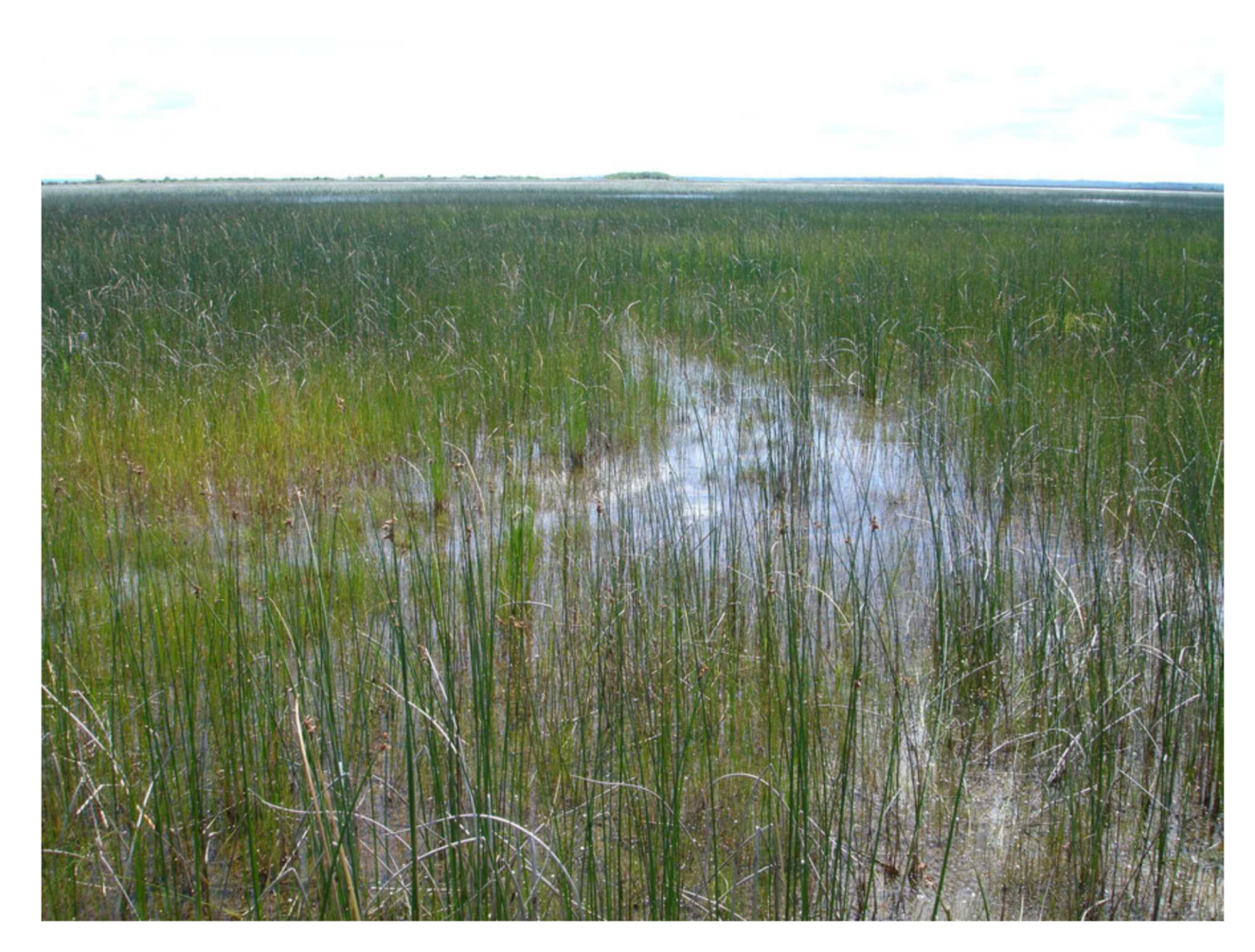
Figure 5. The extensive Great Lakes marsh associated with Munuscong River and Bay is characterized by complex ecological zonation and high native plant species diversity.

This ERA is recognized as a rare natural community as well as being a representative example of the Great Lakes Marsh natural community with excellent estimated viability at the time of its last survey in 2007.