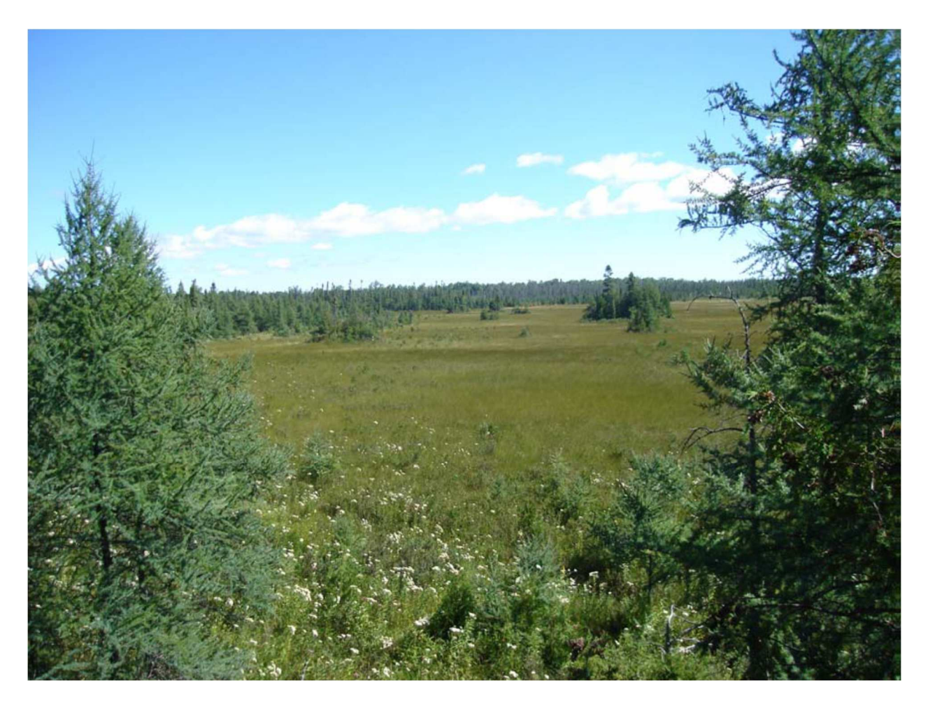
Figure 8. Munuscong Poor Fen.

Following the 2007 survey, this site, which was previously classified as a bog, was re-classified as a poor fen.