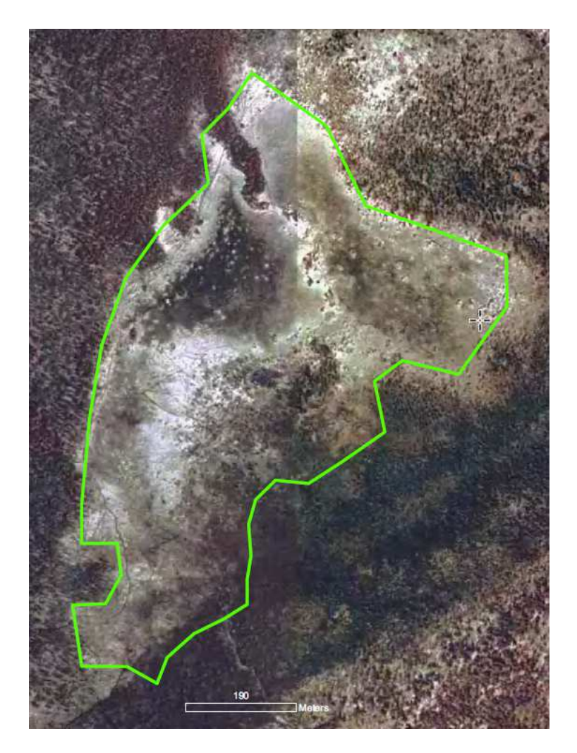
Figure 7. 1998 aerial photograph of Munuscong River poor fen.

Poor fen is a sedge-dominated wetland found on very strongly to strongly acidic, saturated peat that is moderately influenced by groundwater. The community occurs north of the climatic tension zone in kettle depressions and in flat areas or mild depressions on glacial outwash and glacial lakeplain. High-quality poor fens are undisturbed and associated with high quality wetlands and upland communities. Native plant diversity is characteristic of species documented in baseline surveys (Cohen et al. 2008) and MNFI community descriptions and exhibit the full range of vegetative zonation appropriate for the landscape. Invasive species populations are minimal. Hydrology is unimpeded by ditching, diking, or damming, and there should be no evidence of past plowing. The upland area that feeds groundwater into the fen is protected and maintains the quality of groundwater (chemicals, nutrient levels, etc.). Periodic fire disturbance is maintained.