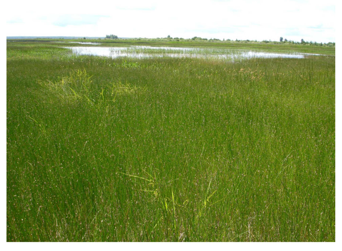
Figure 6. Great Lakes Marsh associated with Munuscong River.

petiolaris ). Broad zones of northern wet meadow are dominated by tussock sedge ( Carex stricta ) and bluejoint grass ( Calamagrostis canadensis ) with wetter portions dominated by tussock sedge and lake sedge ( Carex lacustris ). Wet, recently exposed flats are dominated by rushes ( Juncus spp. ), spike-rushes ( Eleocharis spp. ), and hardstem bulrush ( Schoenoplectus acutus ). These flat areas are often separated from the wet meadow zone by stands of reed ( Phragmites australis ) and narrow-leaved cat-tail ( Typha angustifolia ). Open pools are scattered throughout the site and support submergent marsh with yellow pond-lily ( Nuphar variegata ), common arrowhead ( Sagittaria latifolia ), pickerel weed ( Pontederia cordata ), and pondweeds ( Potamogeton spp. ).