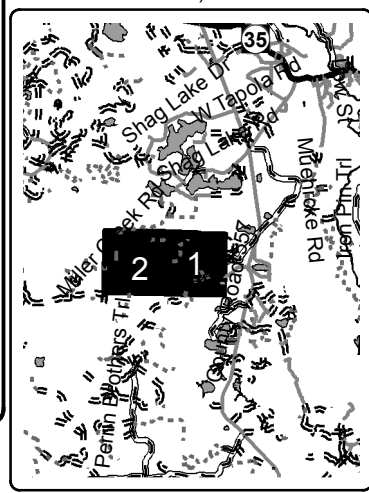
Locator Map 1:200,000